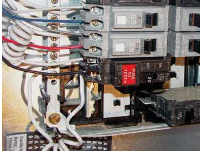
Photo 2. Typical GFCI overcurrent device

The very first reference to a ground-fault circuit interrupter in the NEC occurred in Article 680 of the 1968 edition at Section 680-4(g)(2) pertaining to underwater lighting at a permanently installed swimming pool. In the thirteen editions since the 1968 NEC , the GFCI requirements for swimming pools have grown with each edition as technology has developed and substantiation has warranted. Currently, Section 680.5 permits GFCIs to be self-contained units, circuit-breaker or receptacle types, or any other listed types. Section 680.6 requires all GFCIs associated with swimming pools to be grounded in accordance with Parts V, VI, and VII of Article 250. This is typically accomplished with an equipment grounding conductor. GFCIs do not need an equipment grounding conductor to function properly as GFCIs are looking for a loss of current between the grounded and the ungrounded conductors. However, with Article 680, equipment grounding conductors are specifically required for swimming pool-associated GFCIs. This equipment grounding conductor provides a low impedance path that limits the voltage to ground and facilitates operation of the overcurrent protective device(s). The equipment grounding conductor is required to be an insulated copper conductor not smaller than 12 AWG.