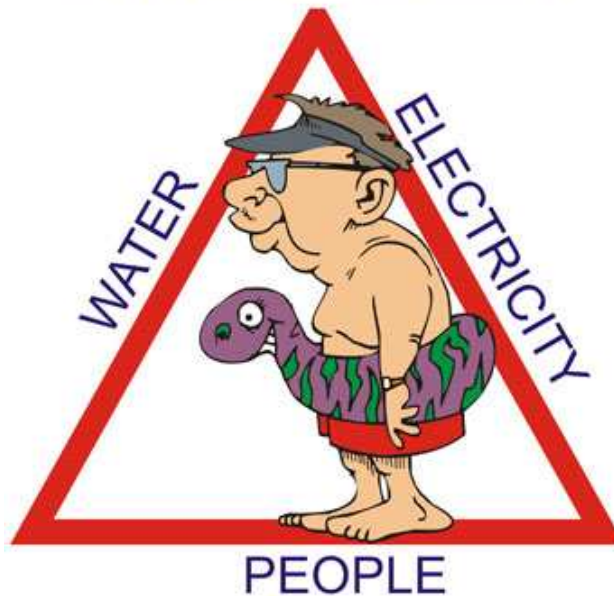
The “Swimming Pool” Triangle