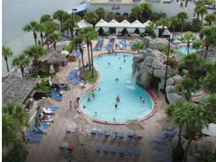
Photo 1. The need for a safe installation is apparent around a swimming pool where water, electricity, and people are present.

With this potentially volatile triangle as our backdrop, it's no wonder that ground-fault circuit interrupters (GFCI) are a major player in and around swimming pools. GFCIs are defined in Article 100 of the NEC as "A device intended for the protection of personnel that functions to de-energize a circuit or portion thereof within an established period of time when a current to ground exceeds the values established for a Class A device." Class A GFCIs, which are the type required in and around swimming pools, trip when the current to ground is 6 mA or higher and do not trip when the current to ground is less than 4 mA. A GFCI will function to de-energize a circuit or portion of a circuit, within an established period of time, where a current to ground exceeds a predetermined value of 6 mA, which is less than that required to operate the overcurrent protective device protecting the supply circuit. There is nothing magic about GFCIs and swimming pools. GFCIs offer no better or worse personnel protection around a pool than in other places that require GFCI protection. However, because of the conductive nature of a large body of water such as a swimming pool, personnel protection from ground-faults is extremely important and necessary. In this article, we will take a look at some of the specific GFCI requirements for permanently installed swimming pools.