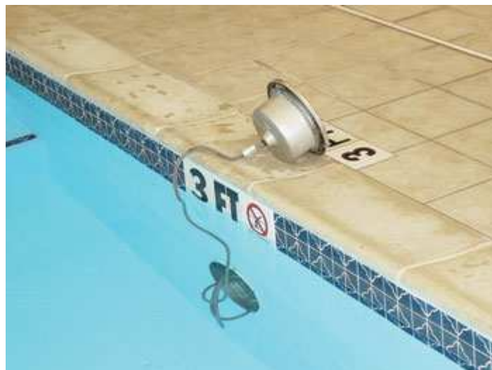
Photo 3. Underwater luminaires require GFCI protection.

Dry-niche, no-niche, or wet-niche underwater luminaires operating at more than 15 volts require GFCI protection per 680.23(A)(8). With underwater luminaires, our pool triangle of